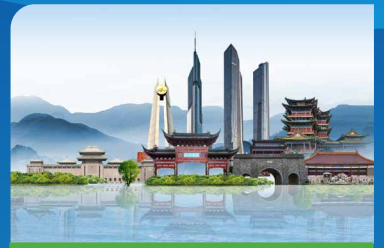
Nanjing, China | July 12-14, 2024

ICSIP was held successfully in Beijing (2016, hosted in North China of Technology), Singapore (2017, hosted in Nanyang Technological University), and Shenzhen (2018, hosted by Shenzhen Research Institute, Southeast University, China), Wuxi (2019, hosted in Southeast University in Wuxi), virtual conference due to COVID-19 (2020, hosted by School of Cyber Science and Engineering, Southeast University), Nanjing (2021, hosted by School of Cyber Science and Engineering, Southeast University), Suzhou (2022, hosted by Suzhou Campus, Southeast University) and Wuxi (2023, hosted by Southeast University in Wuxi). The aim of ICSIP 2024 will bring together the researchers, experts, and scholars from Asian Pacific nations, North America, Europe and around the world to exchange their research results and address open issues in signal and image processing. It is one of the leading international conferences for presenting novel and fundamental advances in the fields of signal and image processing.